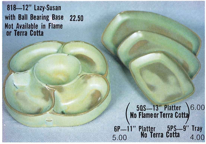
818—12" Lazy-Susan with Ball Bearing Base 22.50 Not Available in Flame or Terra Cotta 5QS—13" Platter 6.00 (No Flame or Terra Cotta) 6P—11" Platter 5.00 5PS—9" Tray 4.00 No Terra Cotta