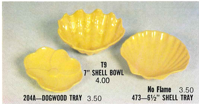
T9 7" SHELL BOWL 4.00 No Flame 3.50 204A—DOGWOOD TRAY 3.50 473—6½" SHELL TRAY