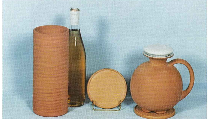
72T - 10" Wine & Beverage Cooler - 7.00 Soak in water, place cool wine bottle inside, keeps wine or beverage cool through evaporation during serving time. AVAILABLE IN TERRA COTTA ONLY 82T - 1 3/4 qt (54 oz) Beverage Server - 15.00 Soak server in water and cool in refrigerator for approximately 20 to 30 minutes. Pour cool wine or beverage in container and serve. Wine or beverage will stay cool approximately 4 hours. AVAILABLE IN DWTC