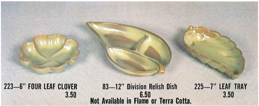
223—6" FOUR LEAF CLOVER 3.50 83—12" Division Relish Dish 6.50 225—7" LEAF TRAY 3.50 Not Available in Flame or Terra Cotta.