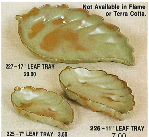
Not Available in Flame or Terra Cotta. 227—17" LEAF TRAY 20.00 225—7" LEAF TRAY 3.50 226—11" LEAF TRAY 7.00