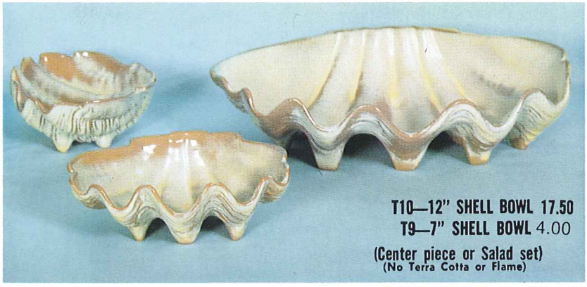
T10—12" SHELL BOWL 17.50 T9—7" SHELL BOWL 4.00 (Center piece or Salad set) (No Terra Cotta or Flame)