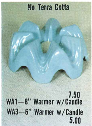
No Terra Cotta WA1—8" Warmer w/Candle 7.50 WA3—6" Warmer w/Candle 5.00

HC - 5" Coaster - (perfect to complete sets above) - 4.00 TERRA COTTA ONLY