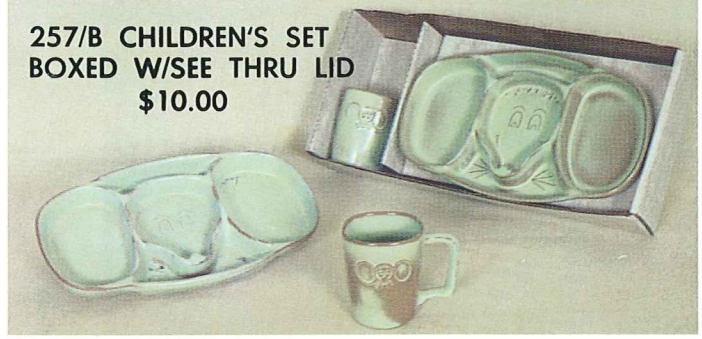
257/B CHILDREN'S SET BOXED W/SEE THRU LID $10.00