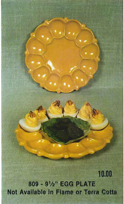
809 - 9½" EGG PLATE 10.00 Not Available in Flame or Terra Cotta